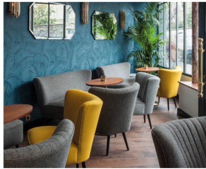
The Hôtel André Latin is an iconic project with a modern twist and a retro lighting inspiration.

The project, André Latin hotel is located in the heart of the «Quartier Latin» close to the Luxembourg gardens and the Pantheon, in the 5th Arrondissement of Paris, which is one of the oldest districts in the capital with its typical streets and universities.